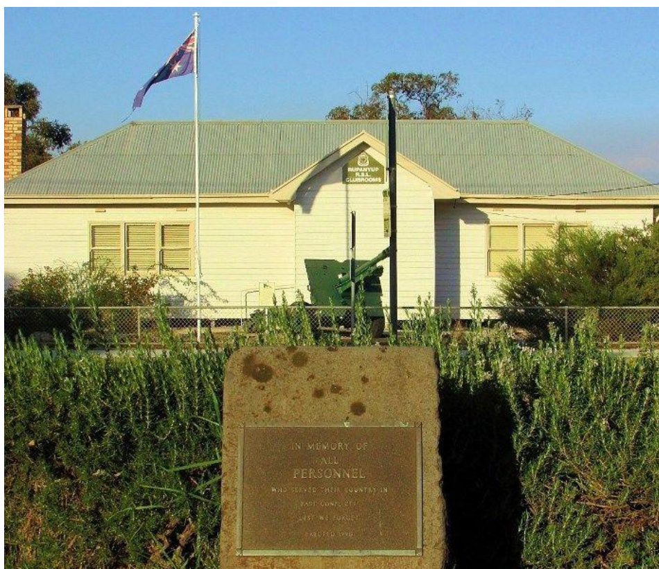
Rupanyup War Memorial

The Rupanyup War Memorial, located on median strip in front of RSL Clubrooms, Cromie Street, Rupanyup does not have individual names.