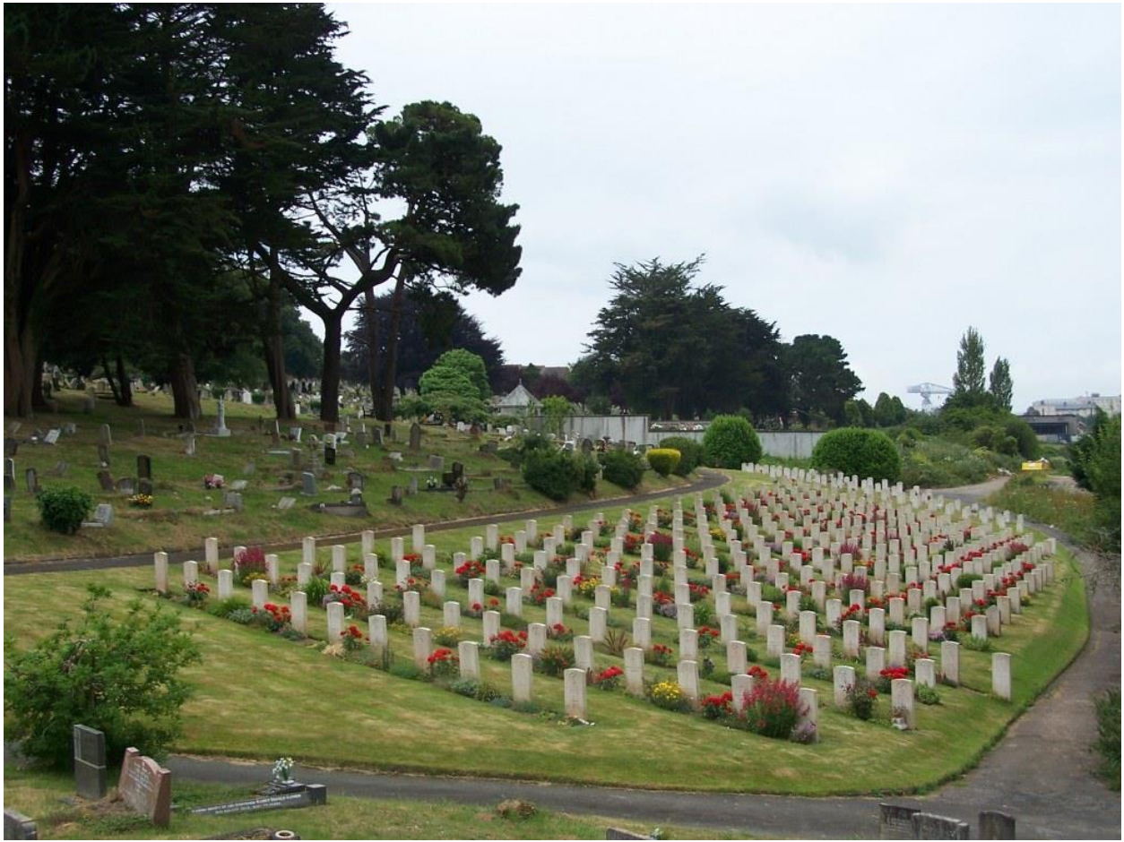
Weston Mill Cemetery, Plymouth, Devon